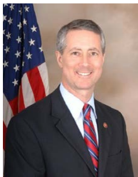
Congressman Mac Thornberry's office